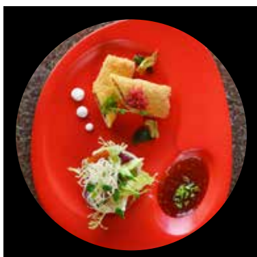
Neo Fusion (Ember)