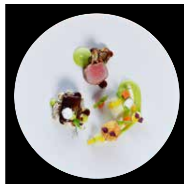
Neo Fusion Black (Volcano)