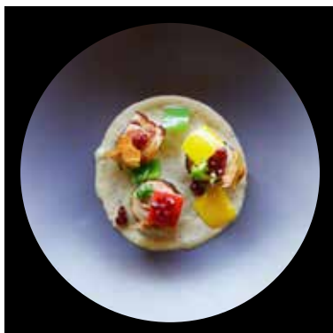
Neo Fusion Grey (Stone)